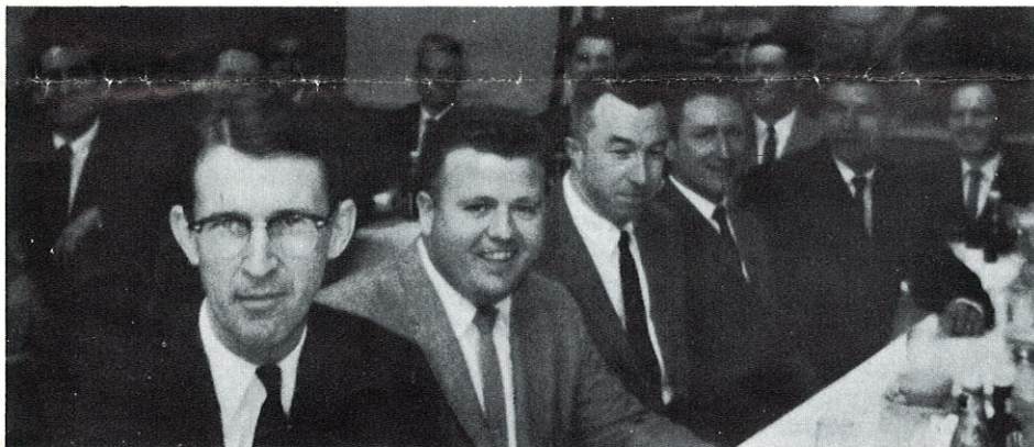
Corpus Christi — San Antonio and Houston Spokesman Clubs in Joint Meeting.